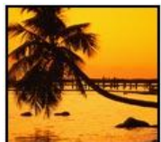
to Key West